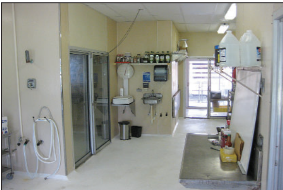
Food Processing Facility