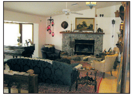
Formal Living Room