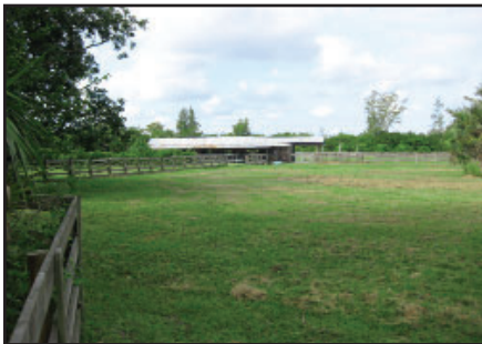
Spacious Pastures overlooking one of the stables

The term “Loxahatchee” is Seminole for “Turtle Creek” which has been the registered name of this 25 acre private farm located in northern Loxahatchee Groves since first established by the owner in 1977. The Property is fully developed including a luxury residence, extensive equestrian improvements, and is being offered together with the seller’s Leechango Plantation business, which grows a variety of fruits and vegetables that are then sundried, packaged and processed in a state-of-the-art, licensed on-site processing facility with a cutting room, several food preparation rooms, drying cabinets and more.