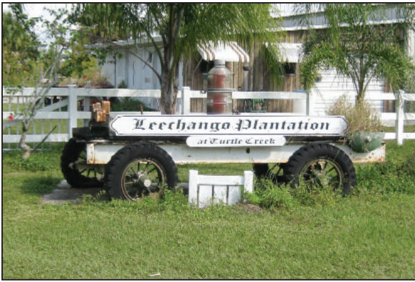
The seller's entire Leechango Plantation business and registered name is included in the offering