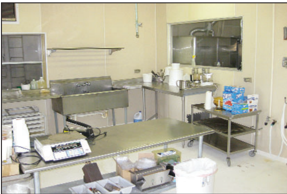
3,000 sf licensed and approved Food Processing Facility and Retail Store