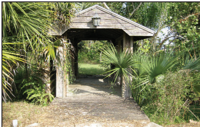
Covered bridge leading to the Residence