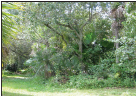
Hardwood walking trails throughout