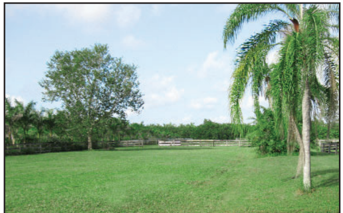
One of many well-fenced paddocks