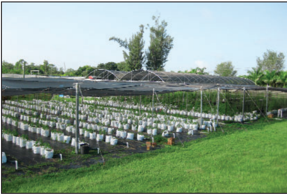
25,000 sf of irrigated shade houses with over 4,000 tomato plants