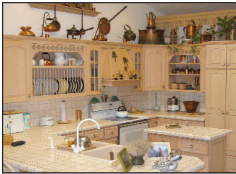
Country Kitchen & Breakfast Nook

Primary Residence: Situated in a mature live oak hammock, the 4,500 sf Tudor Style home is centrally located on the farm to have sweeping views over many of the paddocks and landscaped waterways. Built in 1993 with solid poured concrete construction, the 3 bedroom/2½ bath home includes a formal dining room, living room with wood burning fire place, glass encased arborium, eat-in country kitchen with custom cabinetry, master suite with private office, and numerous porches. All bedrooms include large, cedar lined walk in closets, and external doorways for private entrances. Other features include a walk-in mudroom with outside shower, and covered walkways from the attached two-car garage, which includes a separate one-bedroom efficiency apartment with kitchen, bath and screened porch area. The home is being offered turn-key, fully furnished with numerous certified antiques dating back to the 1920's.